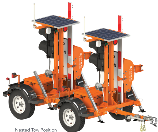
Nested Tow Position